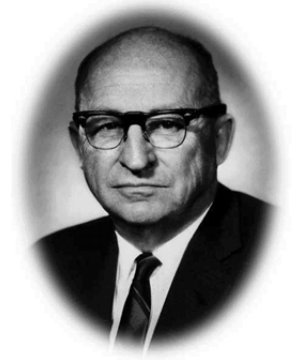
Edwin A. Link